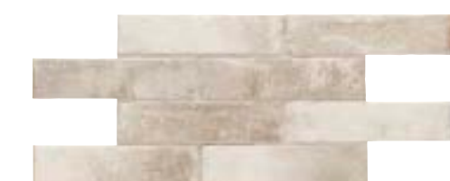
BOSTON BRICK DOWNTOWN TRAB. ENM. 25 x 50 (G 60) 10" x 20"