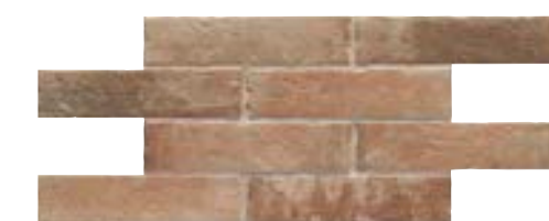
BOSTON BRICK SOUTH TRAB. ENM. 25 x 50 (G 60) 10" x 20"