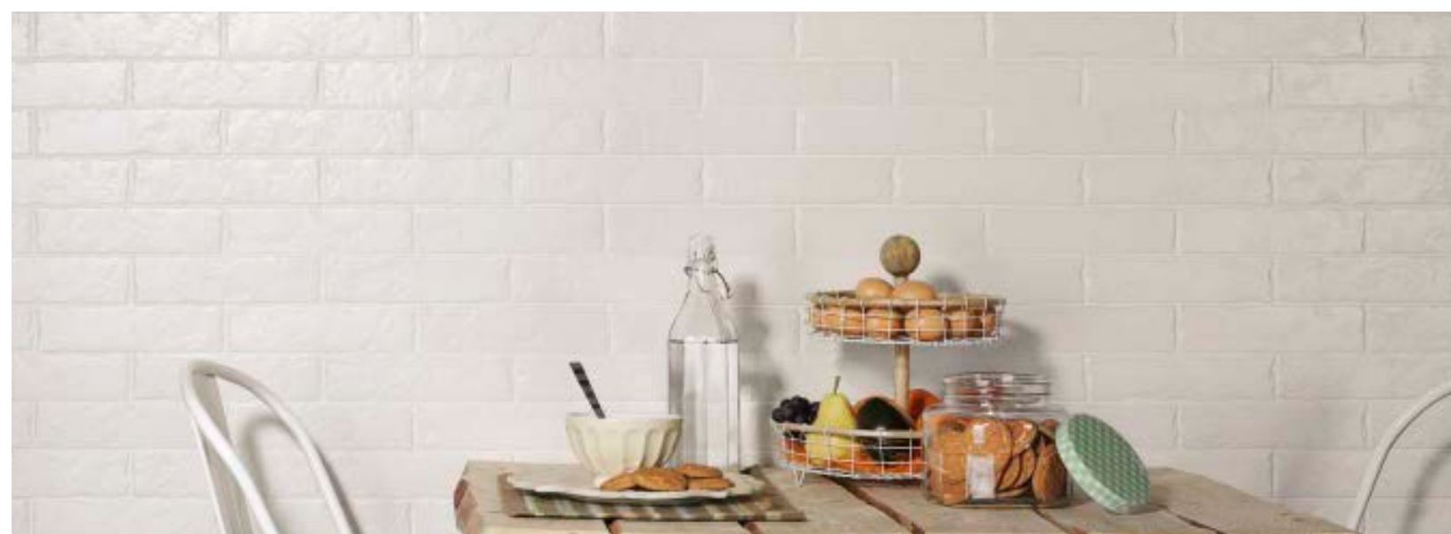
BRILLO - GLOSSY