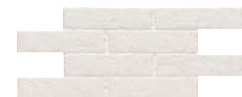
BOSTON BRICK DAY TRAB. ENM. 25 x 50 (G 60) 10" x 20"