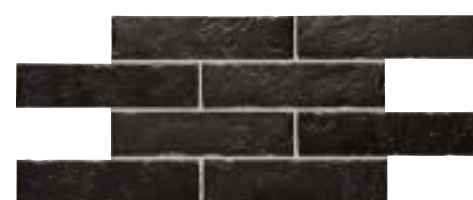
BOSTON BRICK NIGHT TRAB. ENM. 25 x 50 (G 60) 10" x 20"